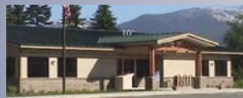
Clark Fork Branch